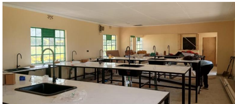
Photo showing science lab-work in progress at Kepchomo Junior School