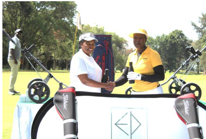
Photo showing handing over of Golf Gift items